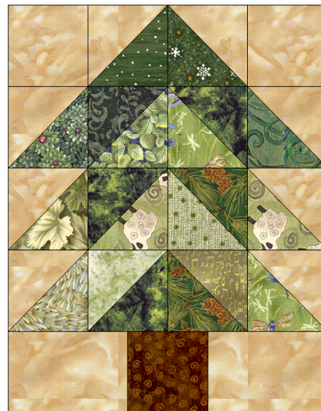
8 1/2" x 10 1/2" Finished Block

To save time at the meeting, please put an address label on the back of your block(s).